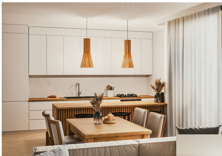
Sample arrangement (arrangement not included in the price).