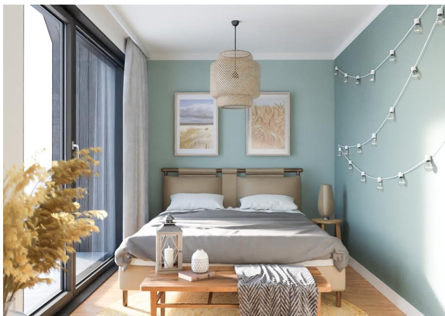
Sample arrangement (arrangement not included in the price).