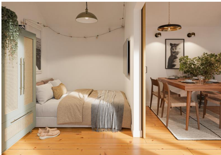
Sample arrangement (arrangement not included in the price).